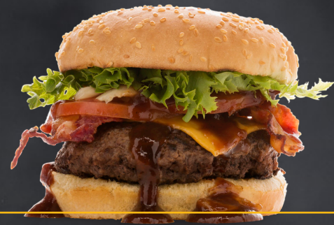
Whiskey BBQ burger

All burgers served with fries & coleslaw