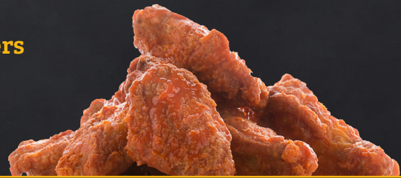
Big Stop wings