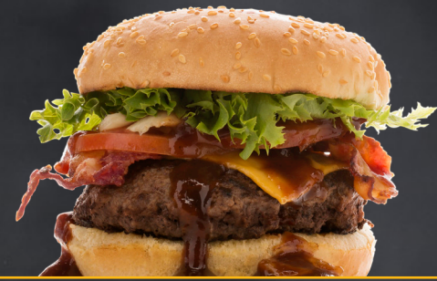
Whiskey BBQ burger

All burgers served with fries & coleslaw