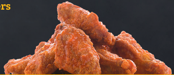
Big Stop wings