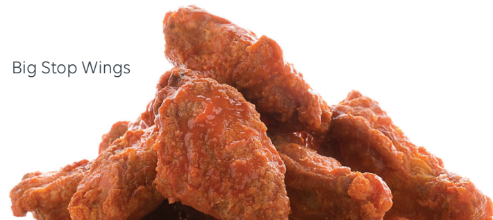
Big Stop Wings