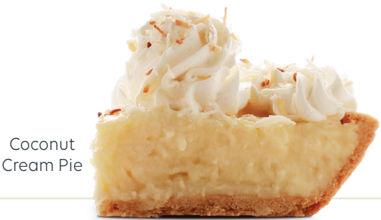
Coconut Cream Pie