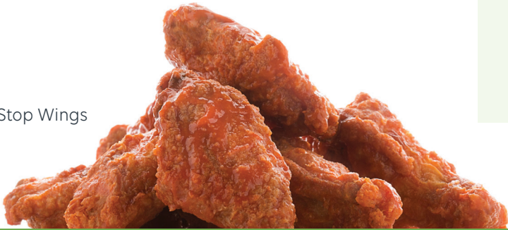
Big Stop Wings