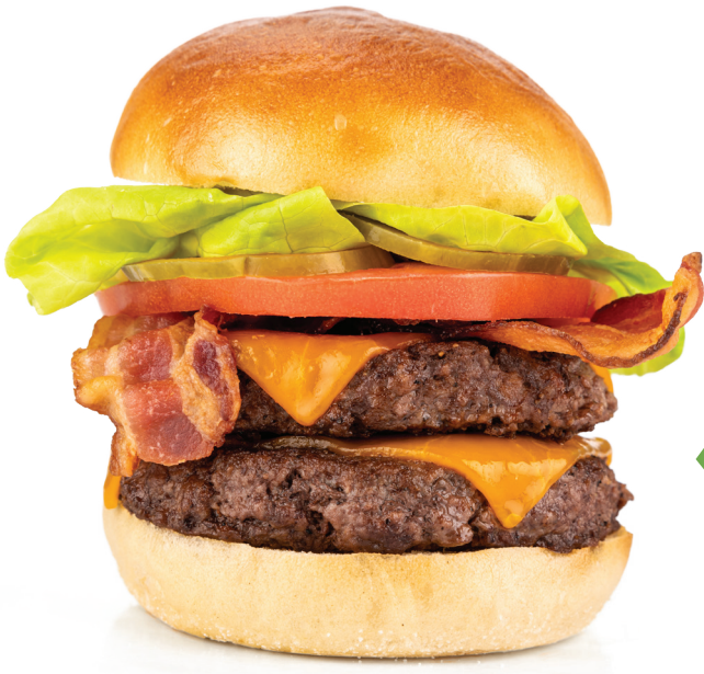
Bacon Double Cheeseburger