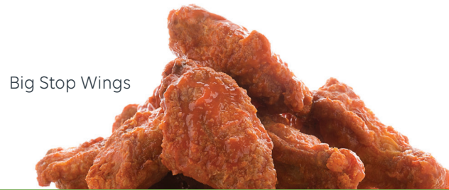
Big Stop Wings