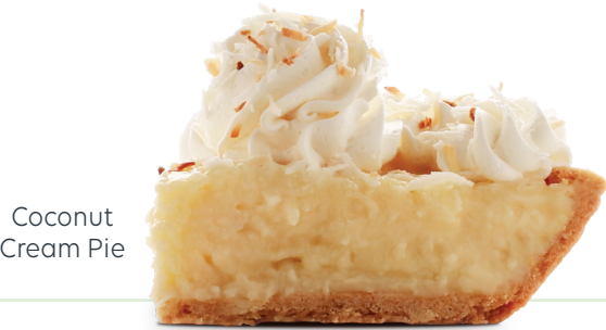
Coconut Cream Pie