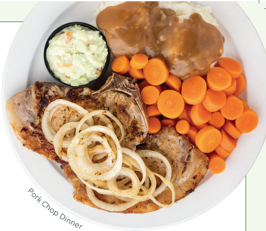
Pork Chop Dinner

Switch the beef in any of our homestyle burgers for a BEYOND BURGER® patty for just 3.99