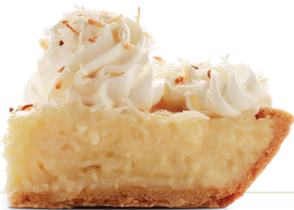
Coconut Cream Pie

CHICKEN FINGERS 14.99 Four pieces of tender, breaded chicken breast strips fried to a golden brown. Served with fries, coleslaw and dipping sauce.