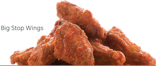
Big Stop Wings