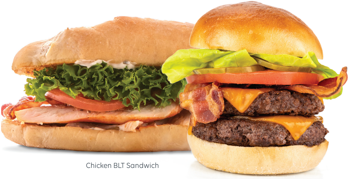
Chicken BLT Sandwich