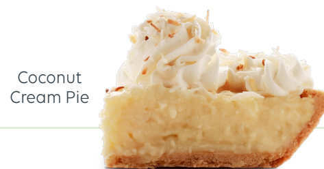
Coconut Cream Pie

BIG STOP COD BURGER 16.49 Lightly breaded cod topped with melted cheddar, lettuce, tomato, pickles and dill ranch sauce. Served with fries and coleslaw.