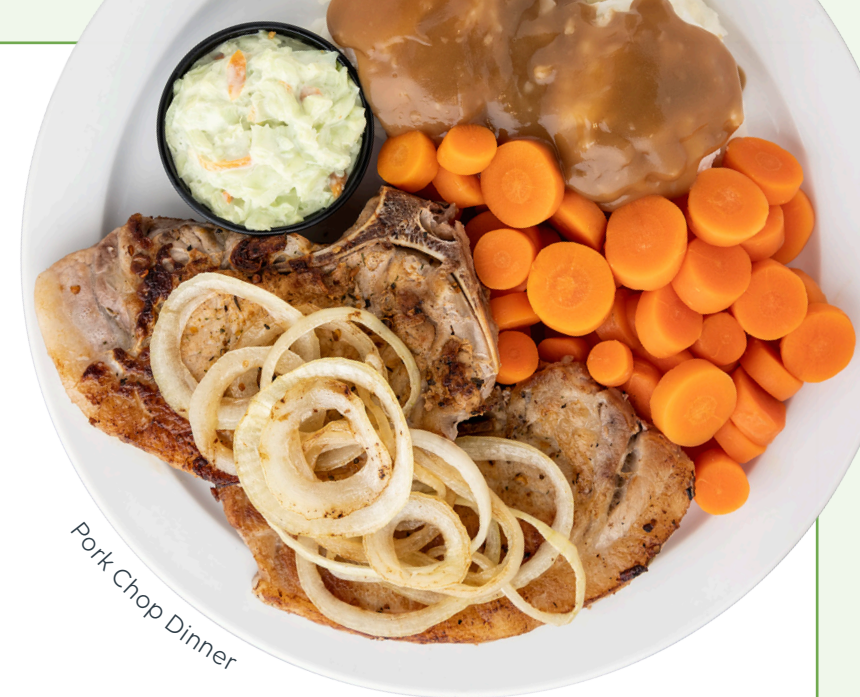
Pork Chop Dinner

Switch the beef in any of our homestyle burgers for a BEYOND BURGER® patty for just 3.99