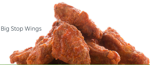
Big Stop Wings