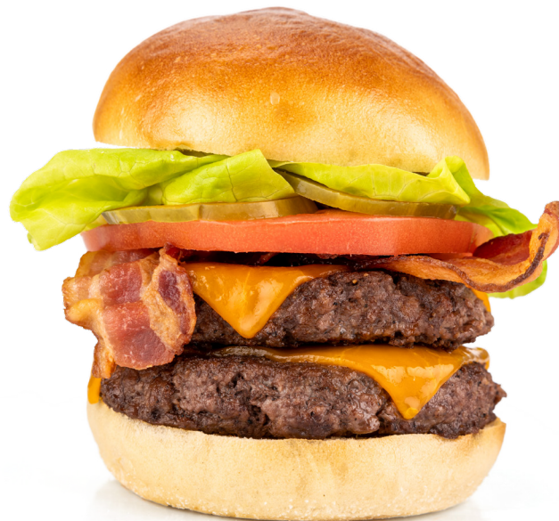
Bacon Double Cheeseburger

CRISPY CHICKEN CAESAR BURGER 16.99 A seasoned, crispy fried chicken breast topped with bacon, Parmesan cheese and Caesar dressing on a garlic-buttered bun.