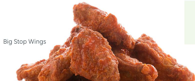
Big Stop Wings

BIG STOP WINGS 16.99 Choose a flavour for your wings: Buffalo, BBQ, honey garlic, sweet chili or salt and pepper. Served with carrots, celery sticks and ranch dressing.