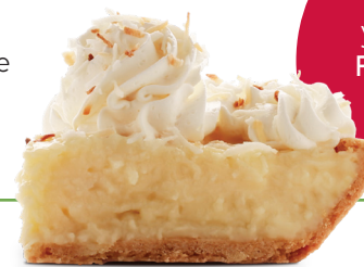
Coconut Cream Pie