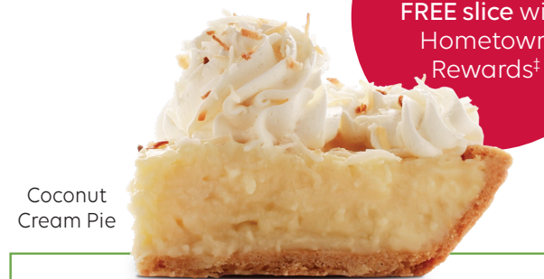
Coconut Cream Pie