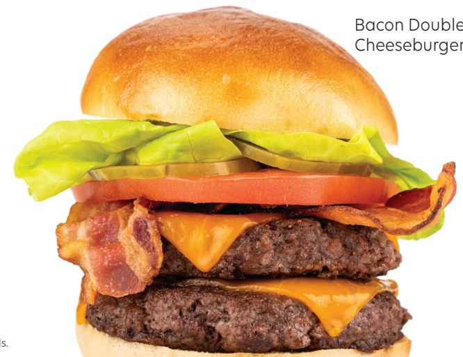
Bacon Double Cheeseburger