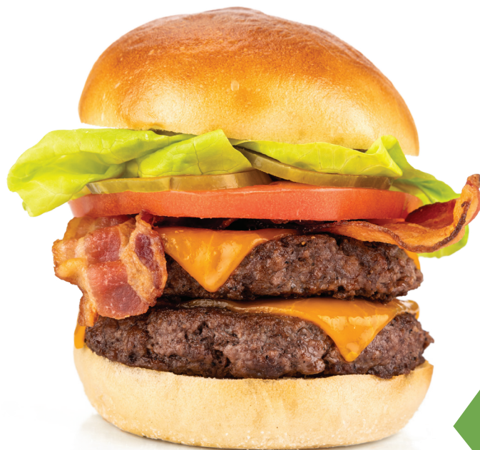
Bacon Double Cheeseburger

SMASH BURGER 16.99 A seasoned beef patty squeezed and grilled between two slices of buttered bread with grilled onions, mayo, mustard and two slices of cheddar.