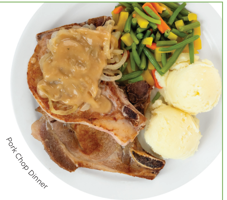
Pork Chop Dinner

†Offer valid at participating Irving Oil locations. Terms and conditions apply. See HometownRewards.ca/offers for details.