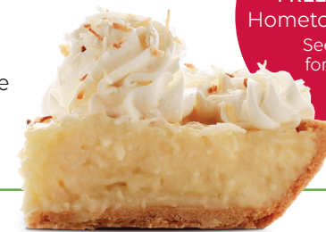
Coconut Cream Pie

BIG STOP COD BURGER 16.99 Lightly battered cod topped with melted cheddar, lettuce, tomato, pickles and dill ranch sauce. Served with fries and coleslaw.