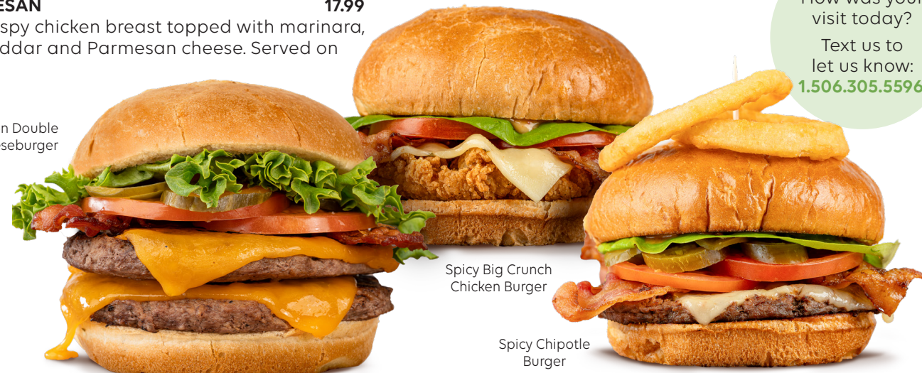
Spicy Big Crunch Chicken Burger