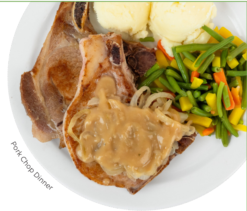
Pork Chop Dinner