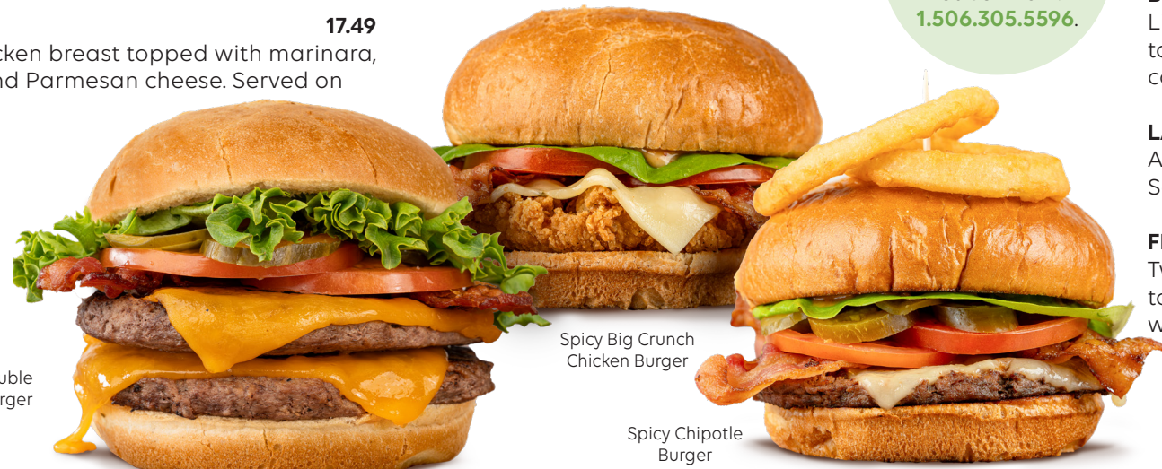
Bacon Double Cheeseburger