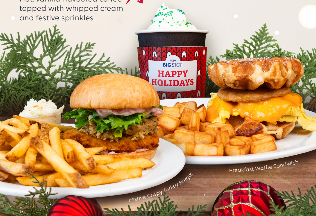
Festive Crispy Turkey Burger

Two eggs scrambled, topped with melted cheddar and your choice of sausage, bacon or ham – stacked between two toasted Belgian waffles dusted with powdered sugar. Served with pancake syrup and golden home fries.