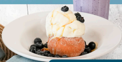
Sugar Donut à la Mode