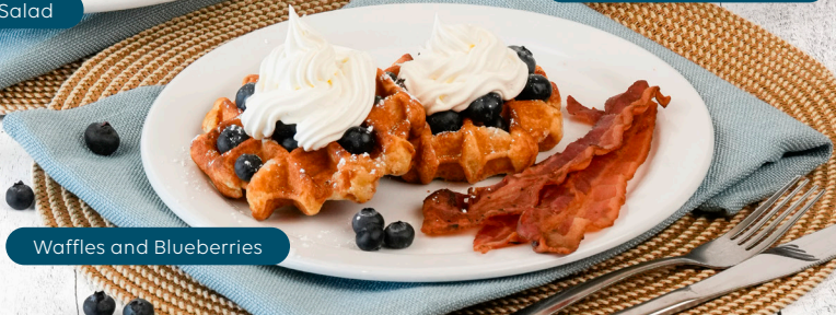
Waffles and Blueberries