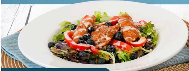
Crispy Chicken Blueberry Salad